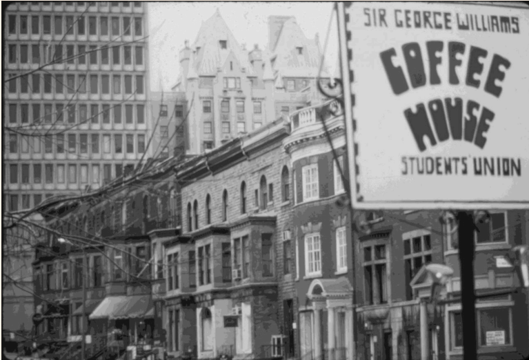
Student Union Coffee House