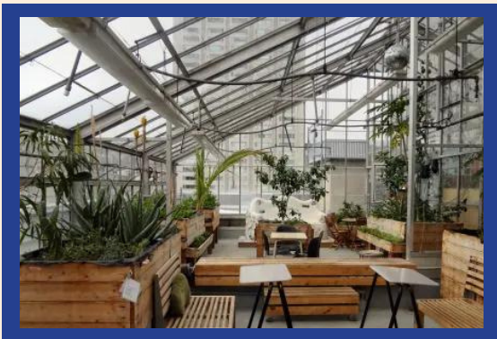
Concordia Greenhouse, 2013

As a fee-levy, the Greenhouse became home to many different sustainability initiatives, such as a composting project, seedling sales, educational workshops, horticulture education, and the City Farm School program.